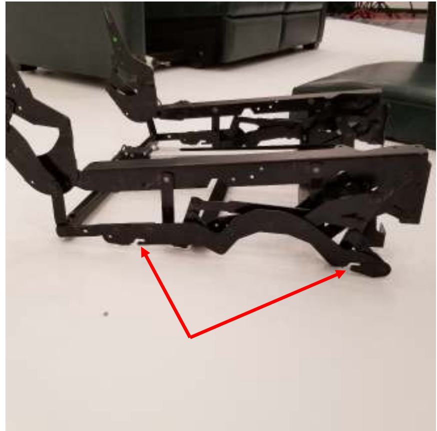
Mounting slots that fit over frame mounting bolts shown.