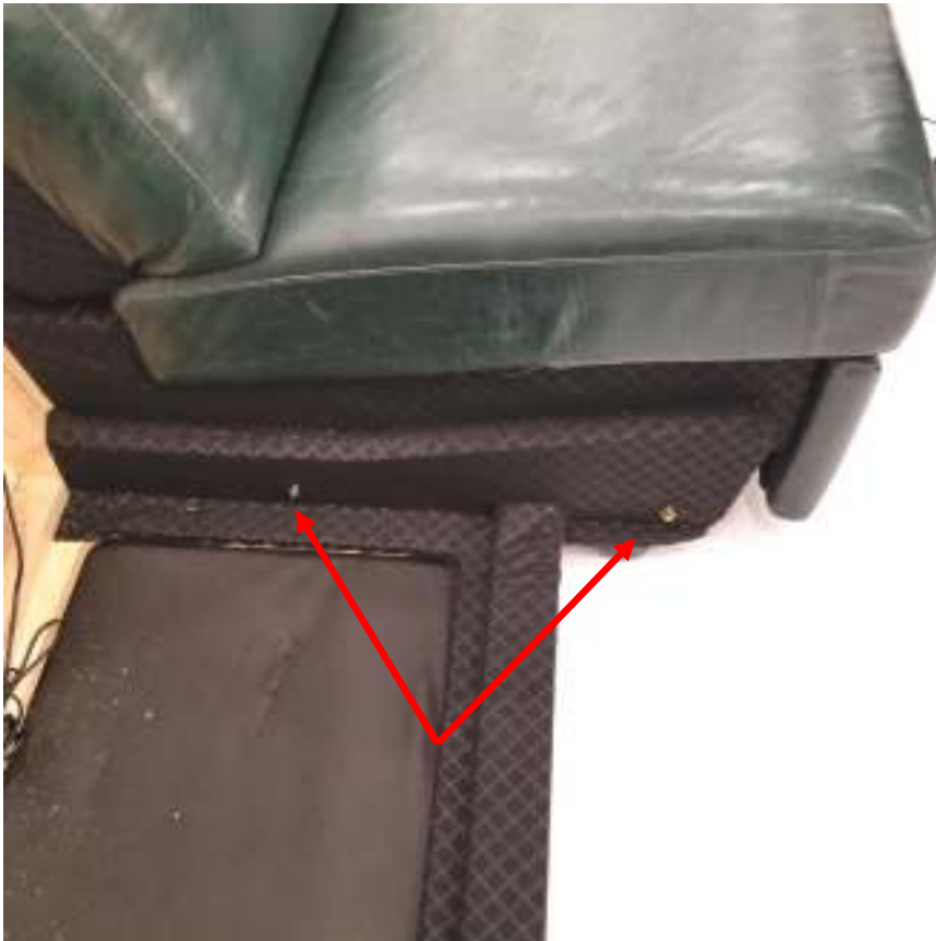
Frame mounting bolts installed loosely for mechanism slots to drop onto.