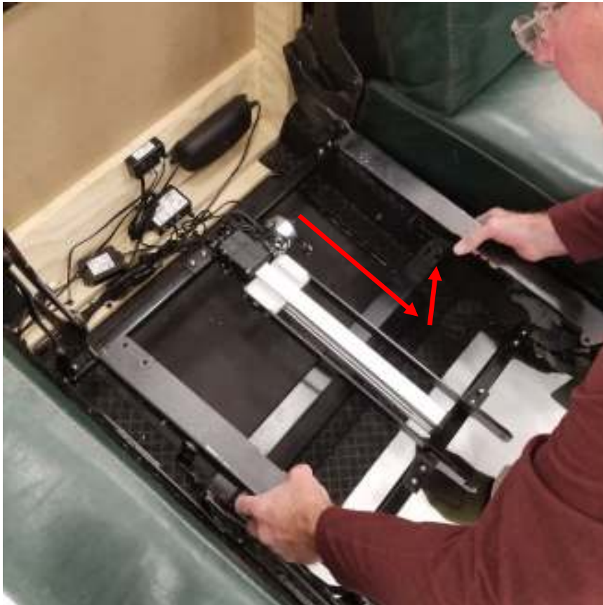
Pull mechanism forward and lift up to remove mechanism from frame.