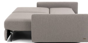
OPEN Width 97" | Depth 59"