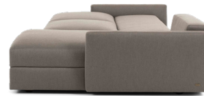
OPEN Width 90" | Depth 59"