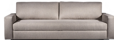
CLOSED Height 32-35" | Width 97" | Depth 40"