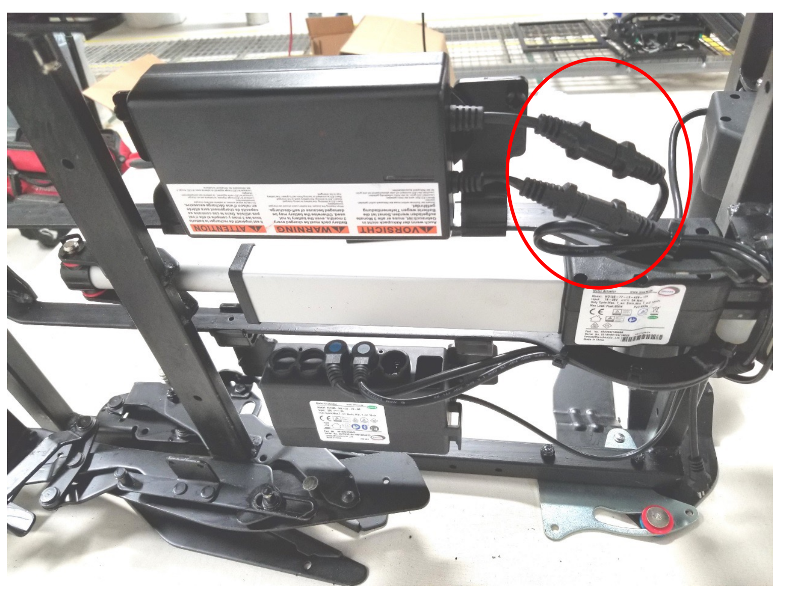
Battery snapped into place and Power Extension Cords plugged into Battery- shown from bottom of mechanism