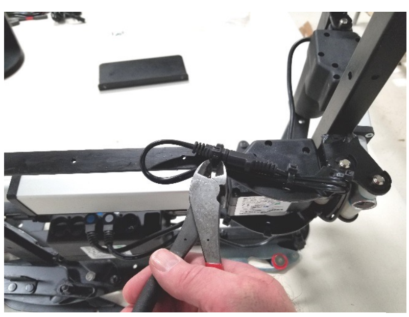
Cut Zip Tie from Power Extension Cords as shown