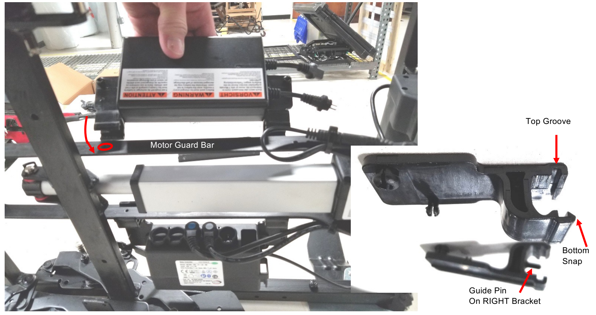
Line up Guide Pin on Right Bracket with hole in Motor Guard Bar. Hook Top Groove onto Bar and swing Battery down to snap in place