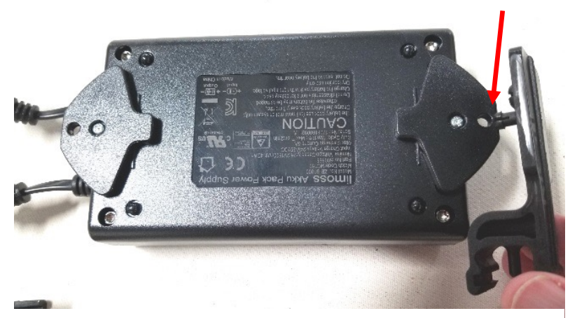
Orient Battery bottom with cords on the left. Install RIGHT Bracket on the right side and snap the fitting into the battery mounting holes as shown